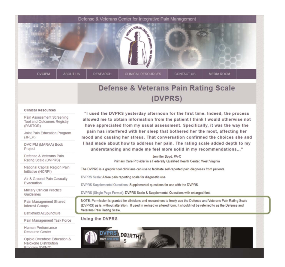
Figure 2: Defense & Veterans Pain Rating Scale (DVPRS).

Youth and adolescents who do not have effective strategies to cope with distress are at increased risk of using maladaptive approaches that are damaging (e.g., misuse of prescription medication, self-medication). When athletes attempt various pain management strategies but continue to struggle with